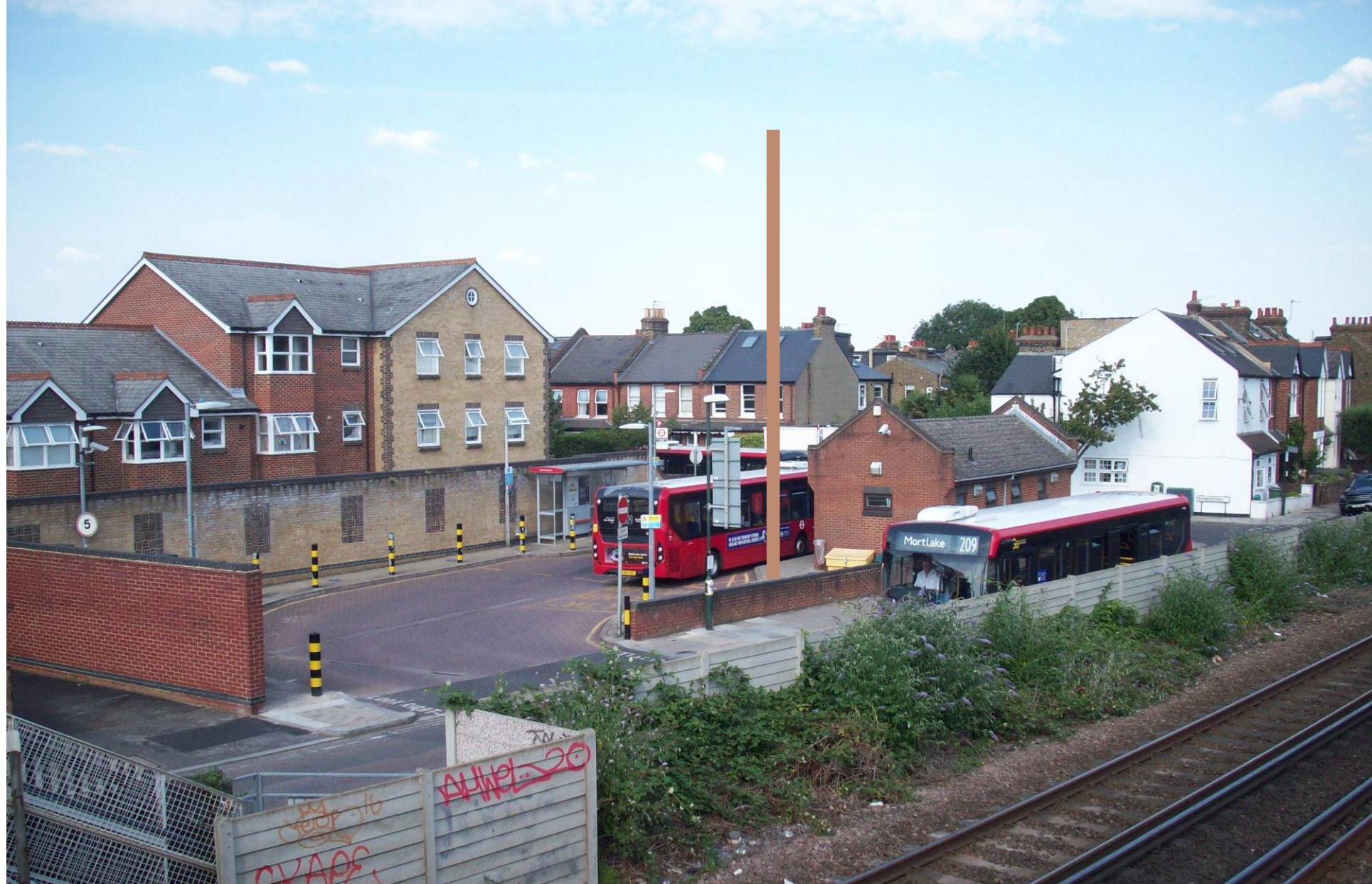
20/2044/TEL Mortlake Bus Turnaround, North Worple Way. 12.5m high monopole for 4G painted brown. There were 170 approx objectors and 3 supporters. MESS reserved its position saying there should be landscaping to soften the impact. Council refused again. Appeal dismissed.