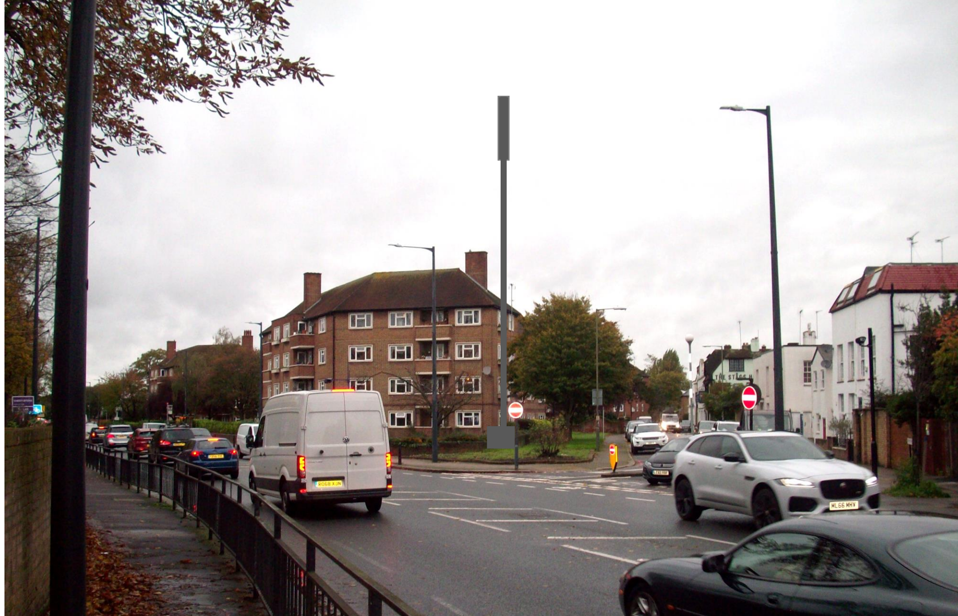
20/2678/TEL Outside The Willoughbys, Upper Richmond Road West. 20m high monopole for 5G painted grey. About 20 objectors. MESS did not object as the site was just outside its area. Application withdrawn after Council indicated potential harm to the character of the area.