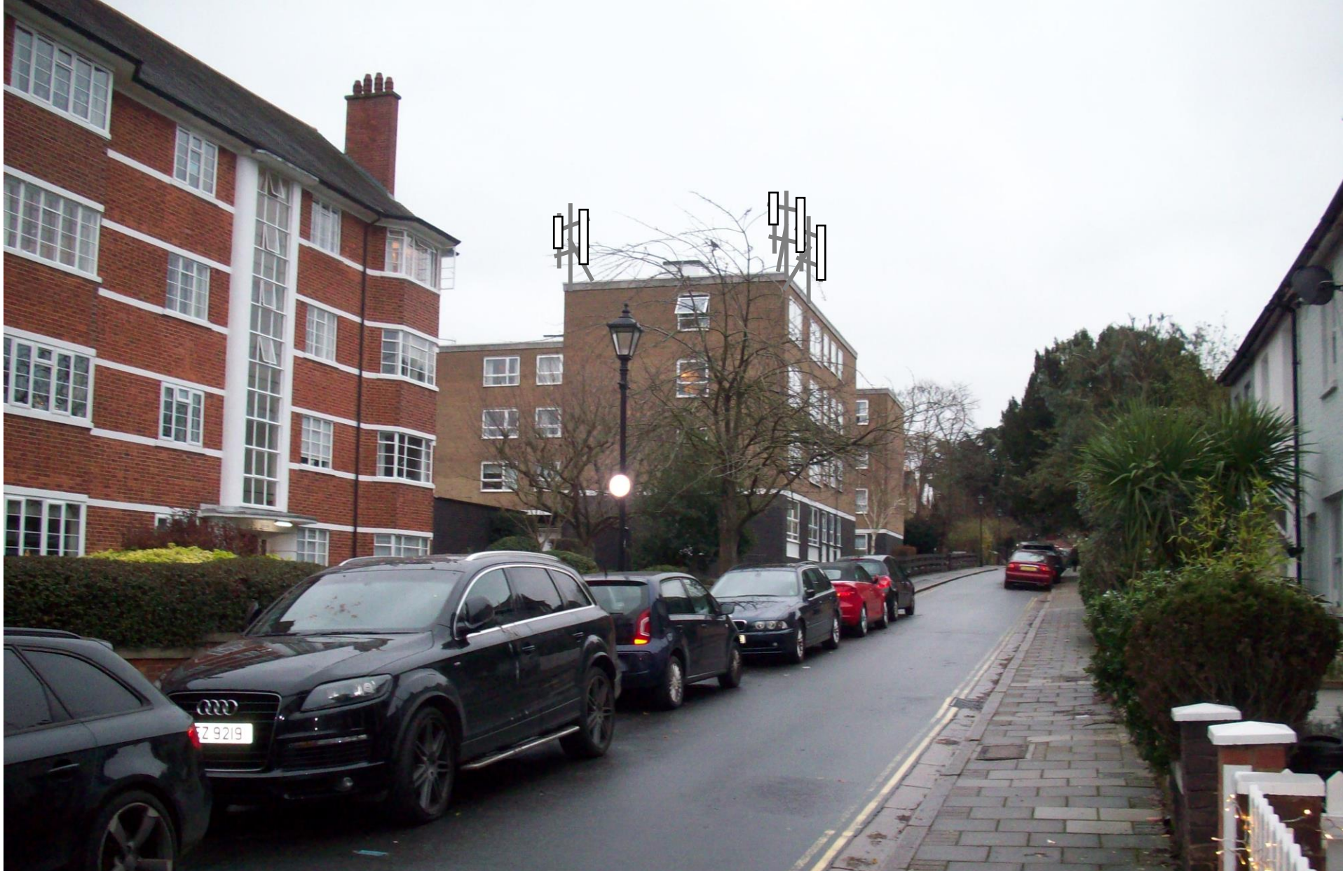
20/3357/FUL On roof of Park Sheen, Derby Road. Antennas for 5G rising 3.7m above parapet and to 15m above ground. MESS objected. Council refused on grounds of the proliferation of intrusive visual rooftop clutter that would harm the character of the building and area.