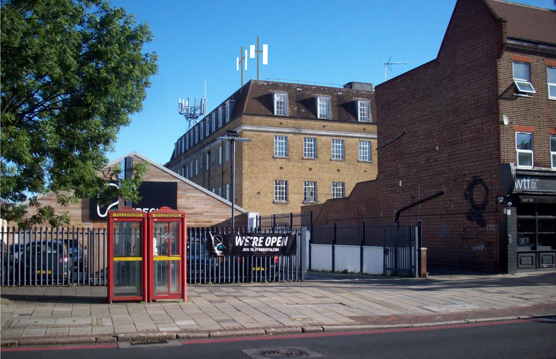
20/2334/TEL On roof of Telephone Exchange, Upper Richmond Road West. 2 x 4.5m high antennas for 5G rising to 21m above ground. 14 objectors. MESS reserved its position noting that aerial masts already exist atop this building. Council approved.