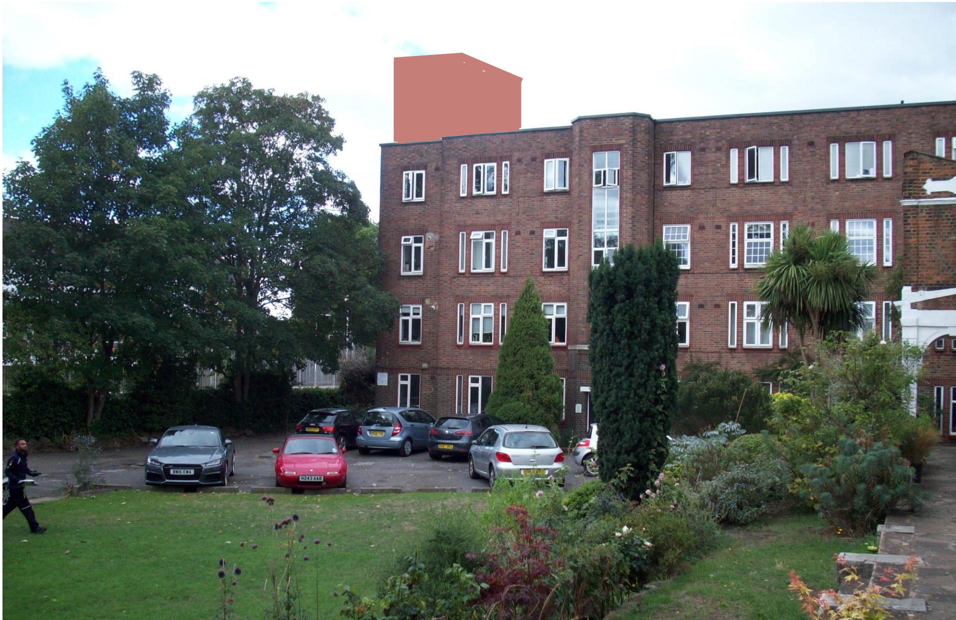
20/1077/FUL On roof of Nos. 40-59 Rosemary Gardens. 2 x 3.4m high antennas for 4G hidden by shroud rising to 13.4m above ground. MESS was one of numerous objectors. Council refused on grounds of intrusiveness and harm to character of Conservation Area. Appeal dismissed.