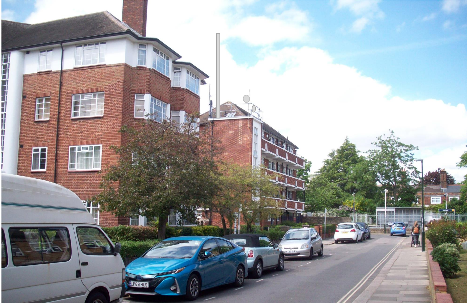
22/1341/FUL On roof of Nos. 101-111 St Leonards Court. 7.5m pole and two 600mm dishes for 5G rising to 18m above ground. MESS objected. Council refused on grounds of harm to the settings of adjacent BTMs.