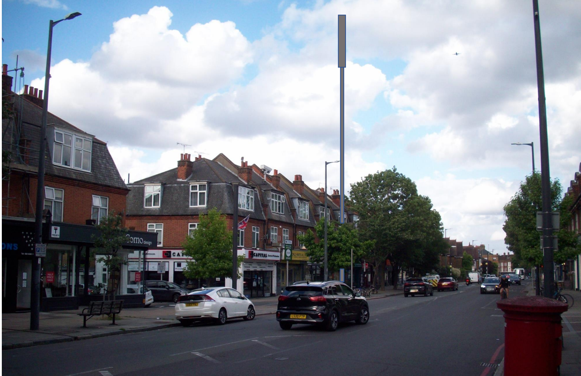
22/1792/TEL Outside No. 350 Upper Richmond Road West at the junction with Carlton Road. 20m pole for 5G. MESS among 17 objectors. Council refused: unduly dominant, incongruous and visually intrusive. Also harmful impact on adjacent BTMs and trees.