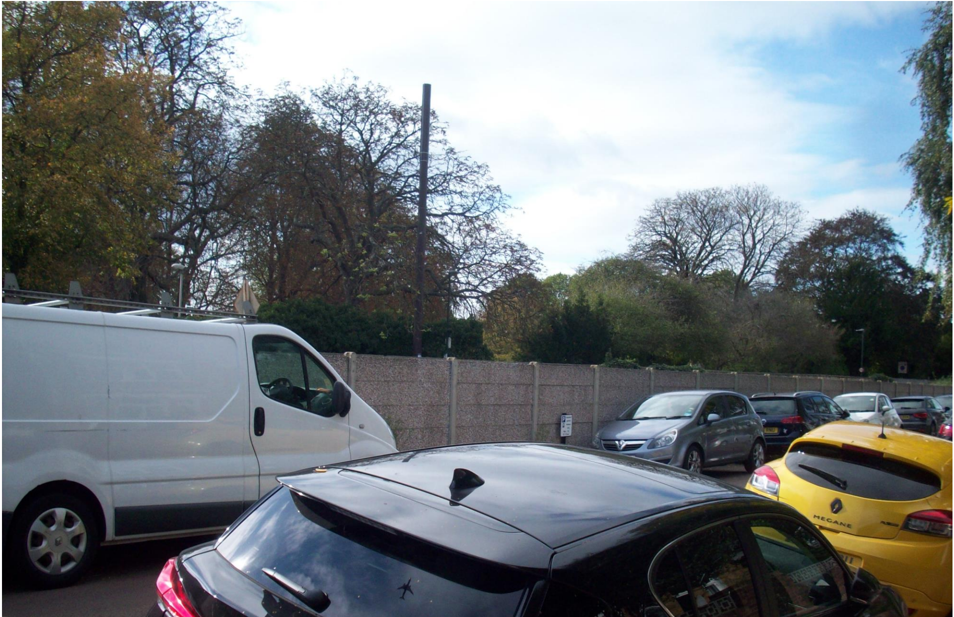
17/0472/TEL Outside Barnes Hospital, South Worple Way. 12.5m high monopole for 4G, painted brown to look like a telegraph pole. There were 8 objectors but MESS reserved its position. Council refused but the applicant appealed and won. Installed in 2019.