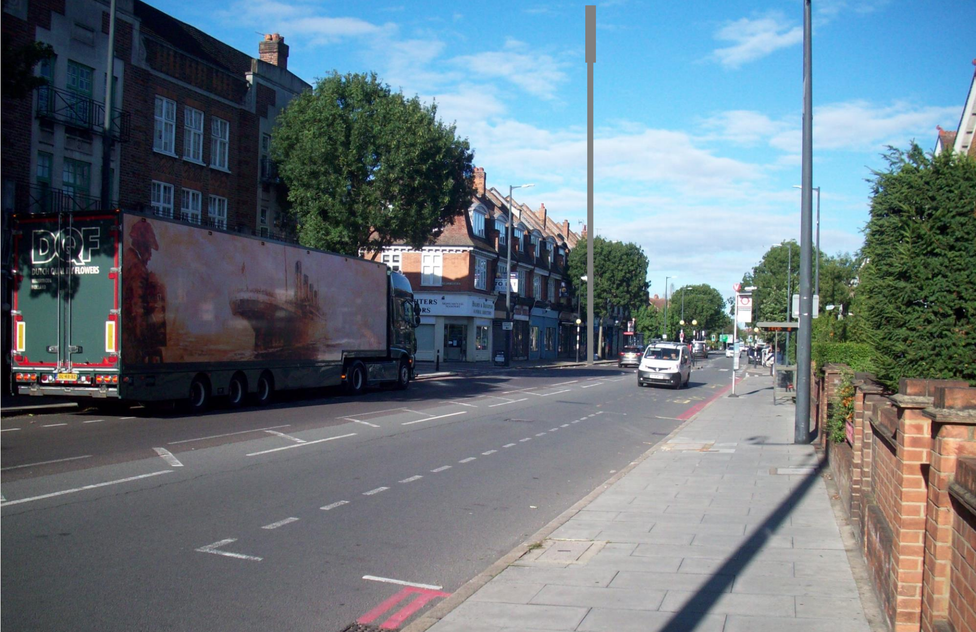
15/1313/MOB Outside Nos. 469-471 Upper Richmond Road West. 25m high monopole for 4G. MESS was one of 445 objectors and there was one supporter. Council refused on grounds of its excessive and dominating scale and visual intrusiveness.