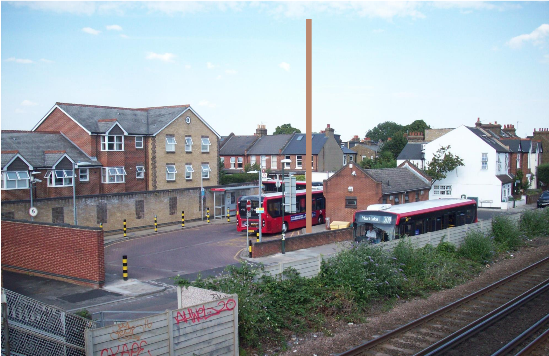
20/1206/TEL Mortlake Bus Turnaround, North Worple Way. 15m high monopole for 4G painted brown. MESS was one of over 200 objectors. Council refused on grounds of its dominance, visual intrusiveness and harm to character of Queens Road Conservation Area opposite.