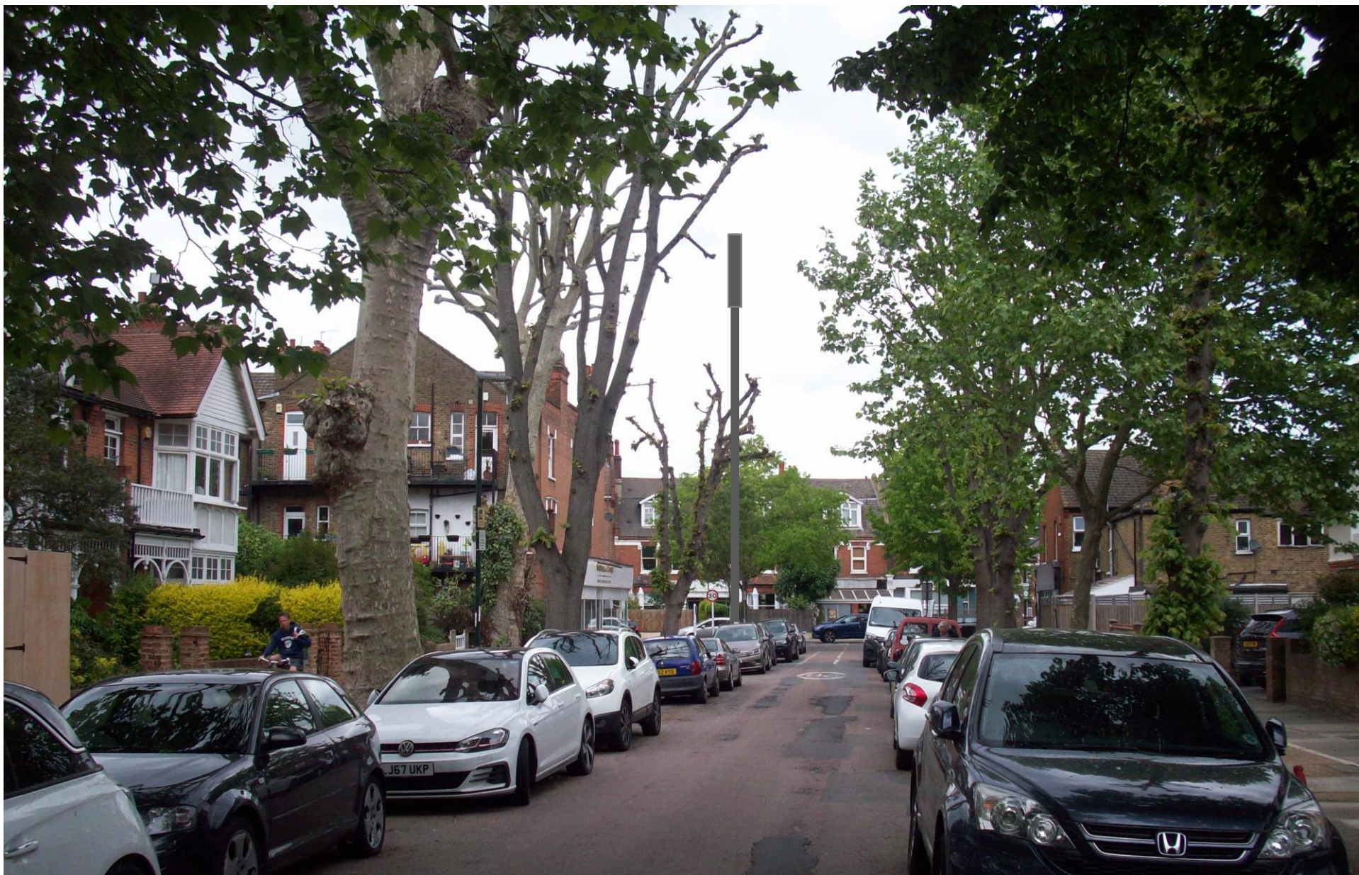
22/1380/TEL Outside bed shop at nos. 215-219 Upper Richmond Road West at the northern end of East Sheen Avenue. 20m pole for 5G. MESS among 120 objectors. Council refused on grounds of adverse impact on East Sheen Avenue Conservation Area and nearby BTMs.