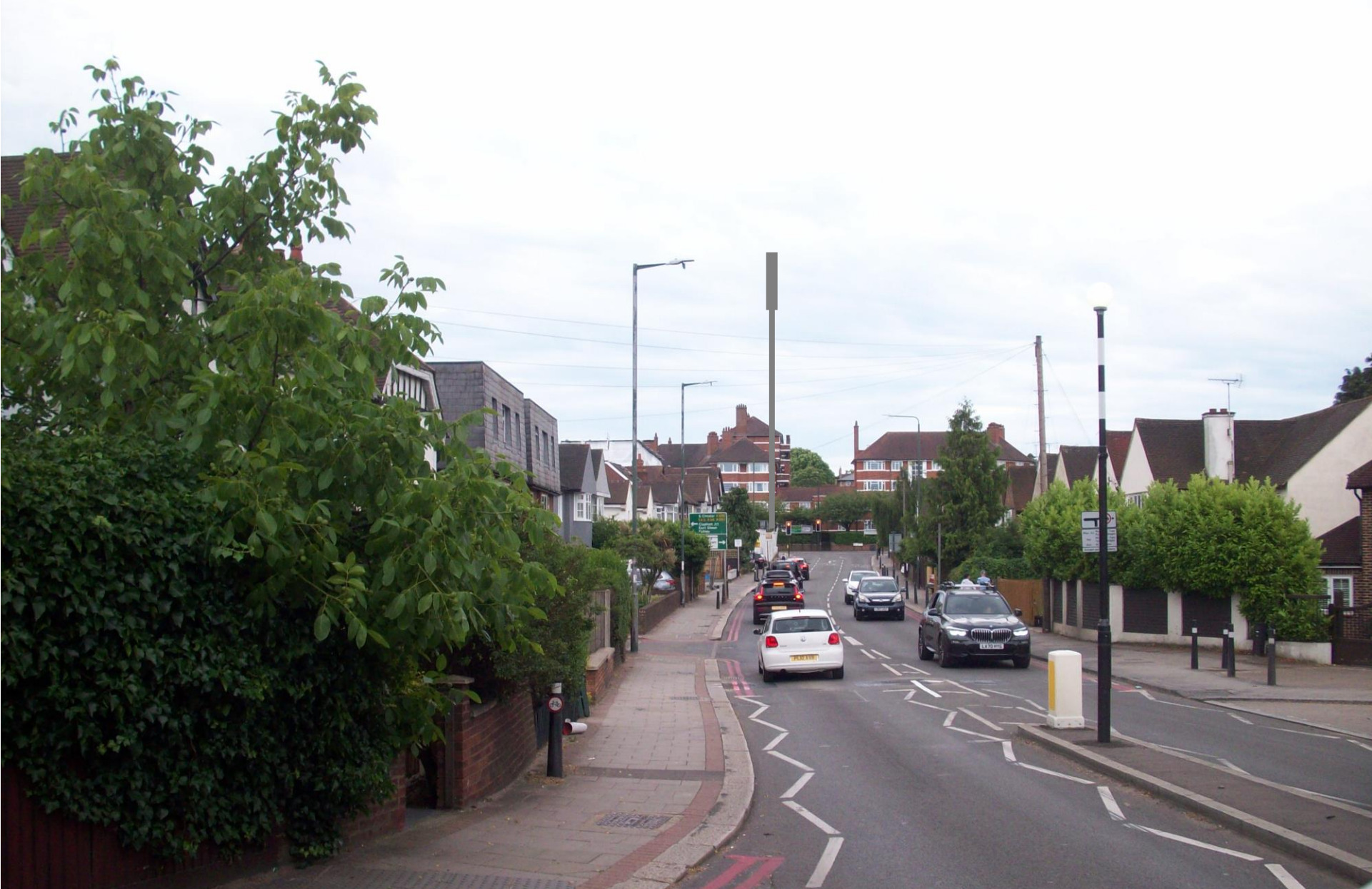
22/1906/TEL Outside No. 424 Upper Richmond Road West at the junction with Clifford Avenue. 20m monopole. View south to junction. MESS among 8 objectors. Council refused: unduly dominant, incongruous and visually intrusive. Also concern from TfL about obstruction.