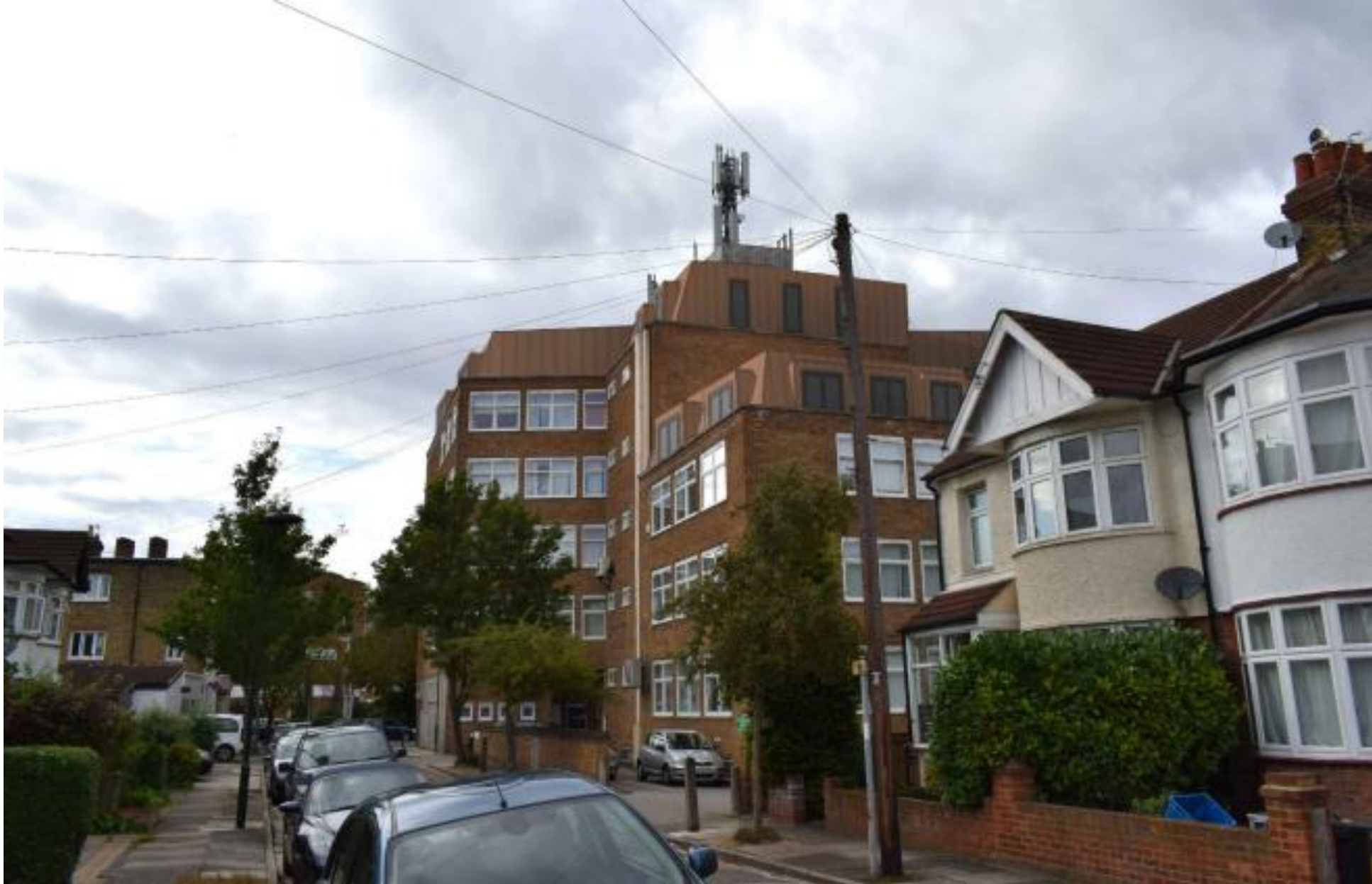
17/4063 Parkway House, Sheen Lane. Application was for additional storey but with no change in height of existing aerial mast (23m above ground), for which a separate application is awaited. MESS objected to the additional storey – Council refused but the applicant appealed and won.